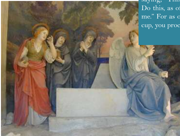
Biblically Inspired Artwork